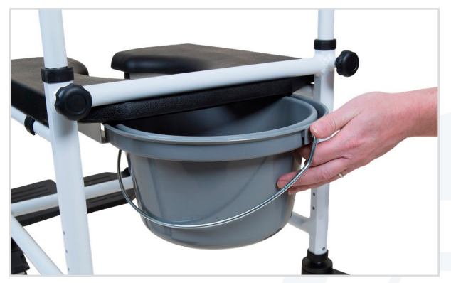
The toilet bucket can be easily removed even when the user is sitting in the chair.

The 5" (125 mm) wheels are easy to mount. All four wheels are lockable and equipped with mud flaps.