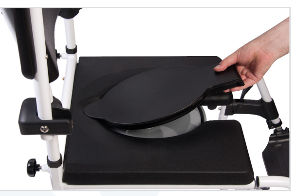
The seat and lid are made of black soft PU foam for comfortable sitting.

The legrests can be mounted without tools and can be folded away to the side to facilitate entry and exit.